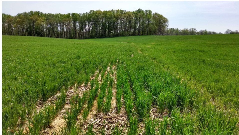
Gully running through the center of the field that was found to be WOTUS (left) and another of the jurisdictional WOTUS on the property.